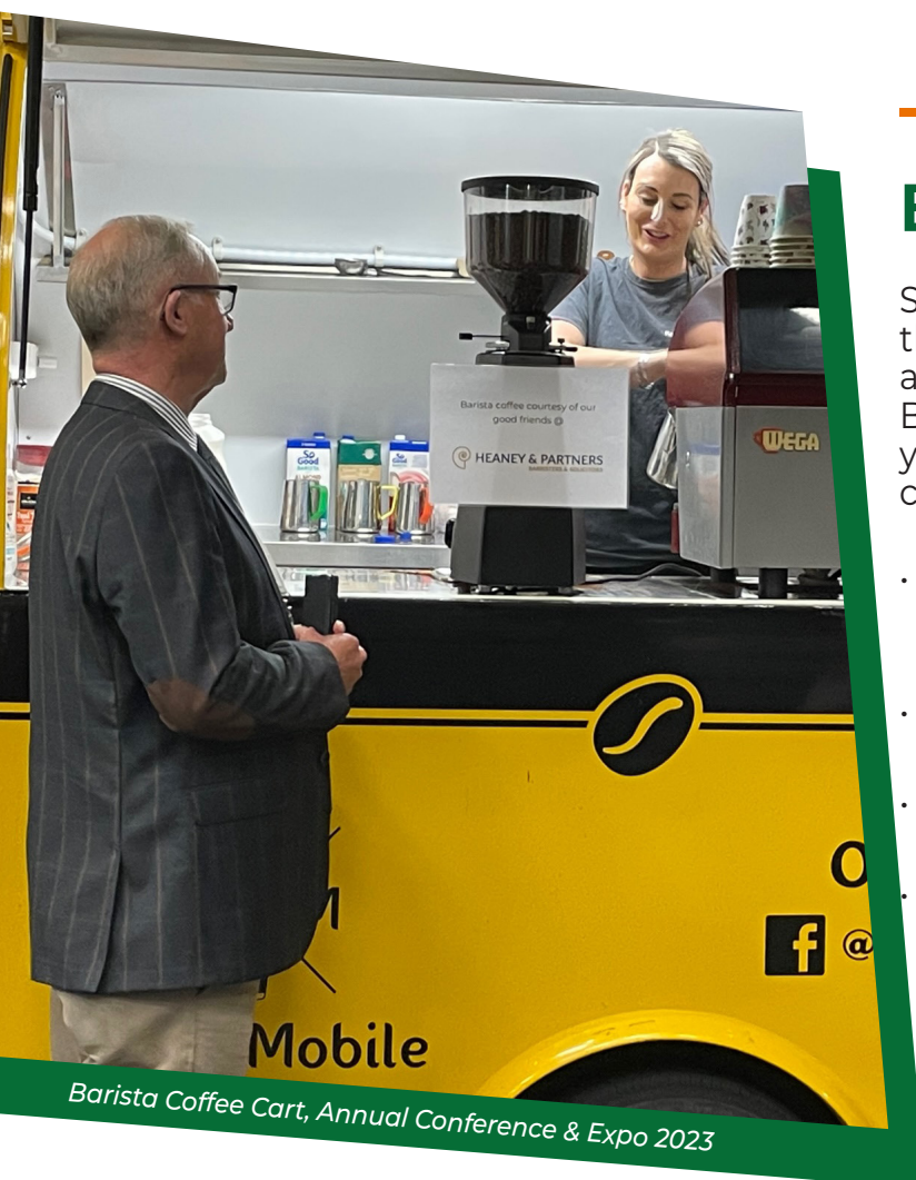
Barista Coffee Cart, Annual Conference & Expo 2023