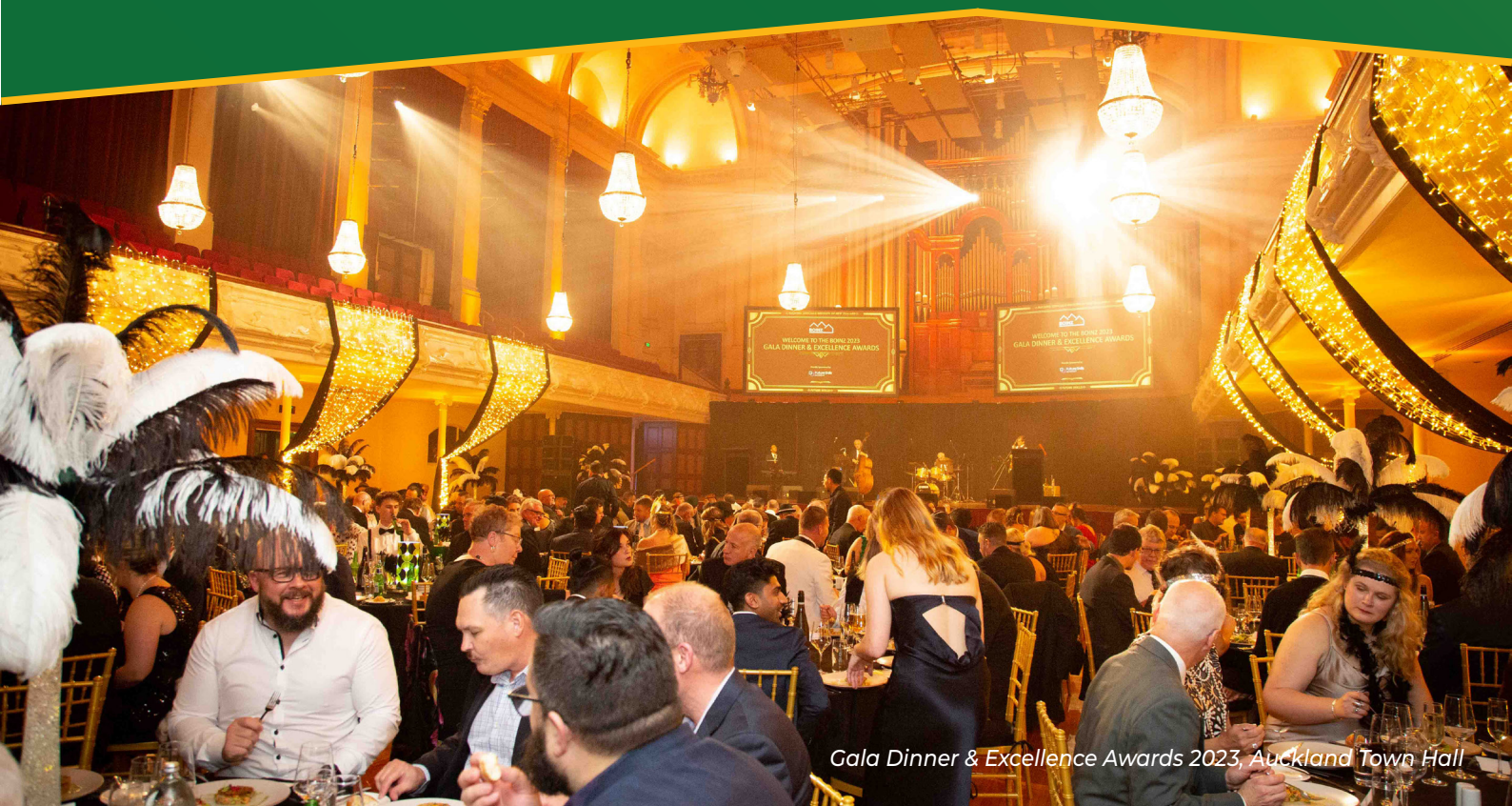
Gala Dinner & Excellence Awards 2023, Auckland Town Hall

For more information please contact Marketing@boinz.org.nz