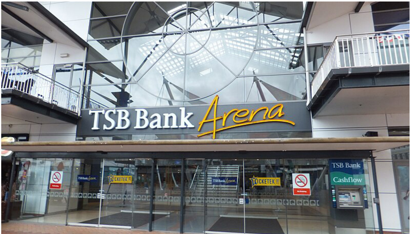
Entry to TSB Arena.JPG