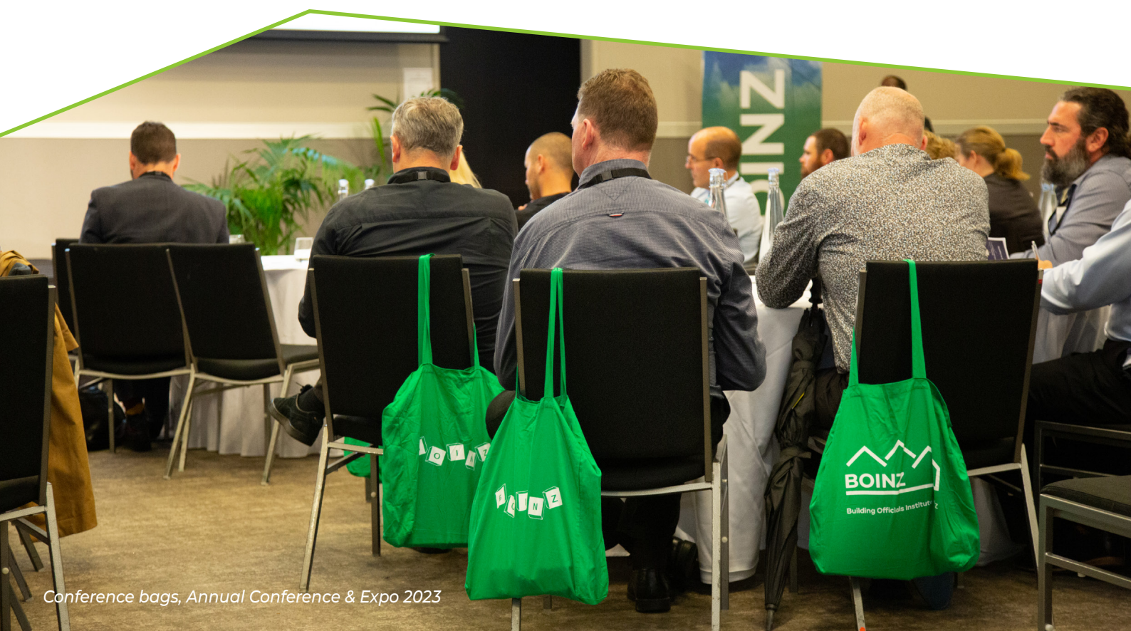
Conference bags, Annual Conference & Expo 2023

The Bag will be selected and supplied by BOINZ Conference 2024 organiser.